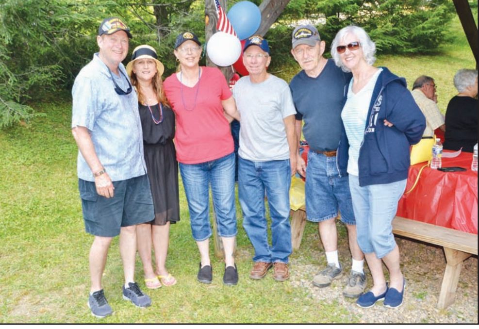
Just a few of the many veterans who attended the veterans barbecue with their families at Trackrock Campground on June 1.