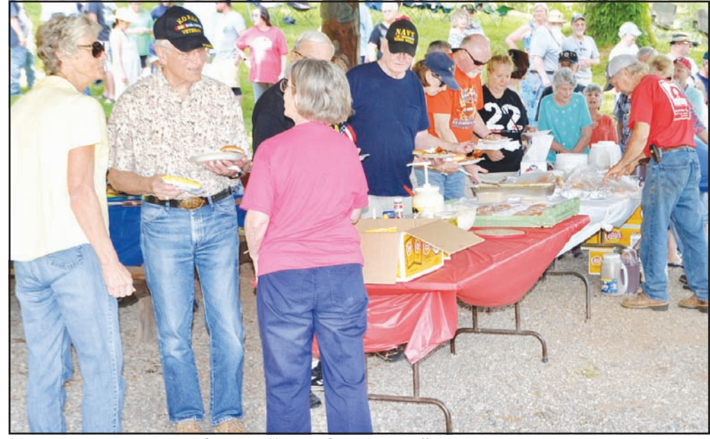
Many veterans gathered for the "A Day for Veterans" barbecue and concert at Trackrock Campground & Cabins on Saturday, June 1.

The occasion also acted as a way for the community to remember what veterans went through during their service. 'A lot of people have for-